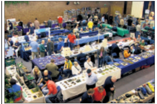
World in miniature: visitors to last year's show.

If you are interested in the club, ring Anne on Huntingdon 458935.